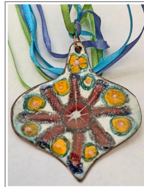
Ornament by Adeola d-Aiyelija