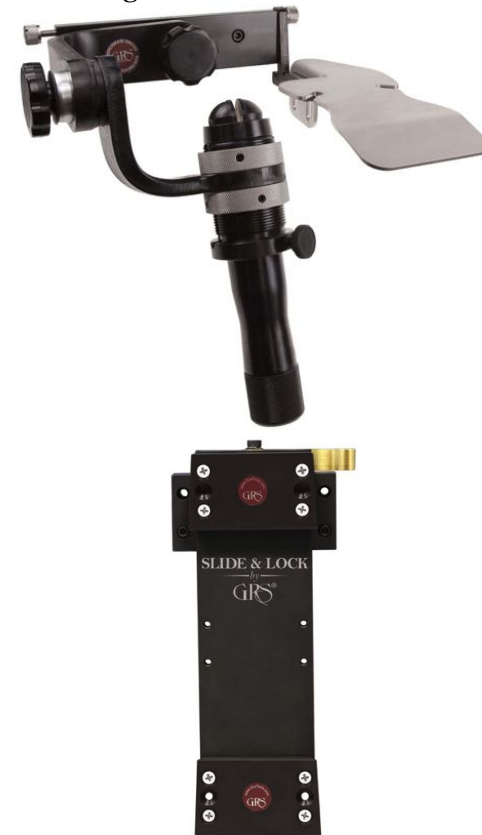
Top: Steel bench pin. Above: Slide and lock; these are just a few of the tools that work together Available at RioGrande.com

Tools that make me ask myself, "What took me so long to get this??" : GRS BenchMate tools. These tools deliver the widest range of motion available from any hands-free work holding tools.