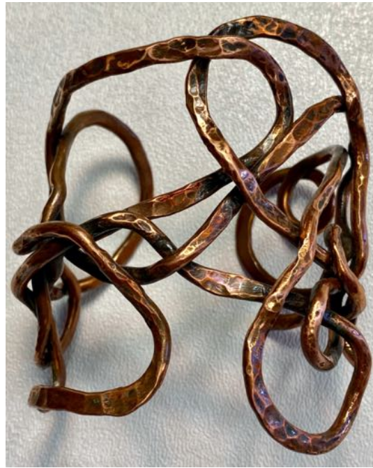
Hammered texture copper wire cuff