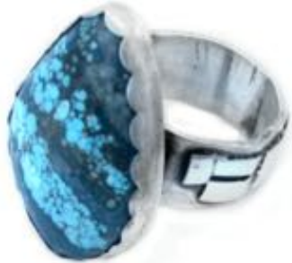
Turquoise ring with decorated band