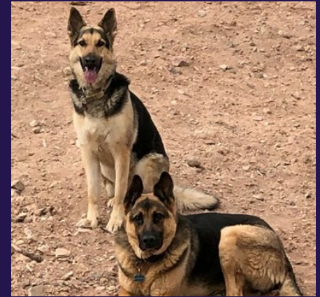
Bill's photo of his inspiration