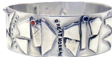
Ring made using scrap silver accents

For August's Monthly Makers Challenge , we want you to dive into your scrap box. Feel free to make anything you want, just please take a picture of the pieces you pull out before you start. Don't forget to take various photos throughout the process along with your finished piece. We want to showcase what you are creating in upcoming newsletters. Sign up sheet coming soon!