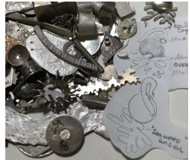
Dig in to that scrap box!