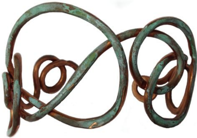
Copper patinated wire cuff

Trudy Adler's collection of hand formed heavy wired copper cuffs. For more info: trudyadler@earthlink.net