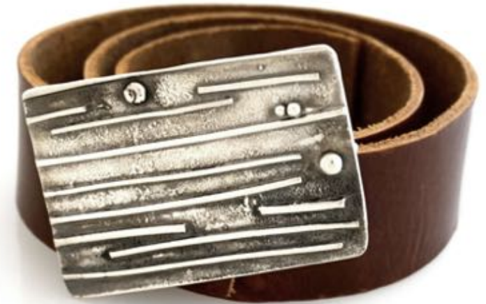
Belt buckle in sterling silver