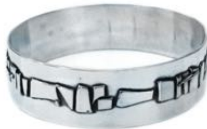
Sterling silver scrap decorated bracelet