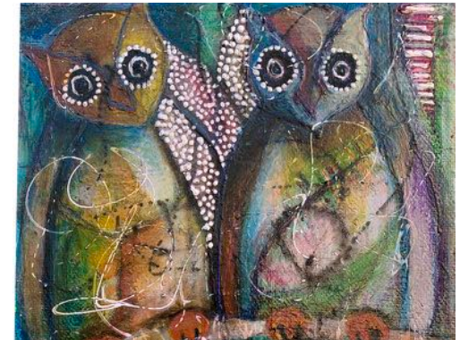
Adeola's owl painting