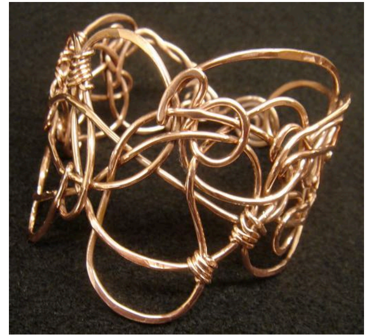
High shine twisted wire cuff

Margot Michon's collection of scrap metal pieces, a wide variety in both silver and gold https://www.margotmichon.com